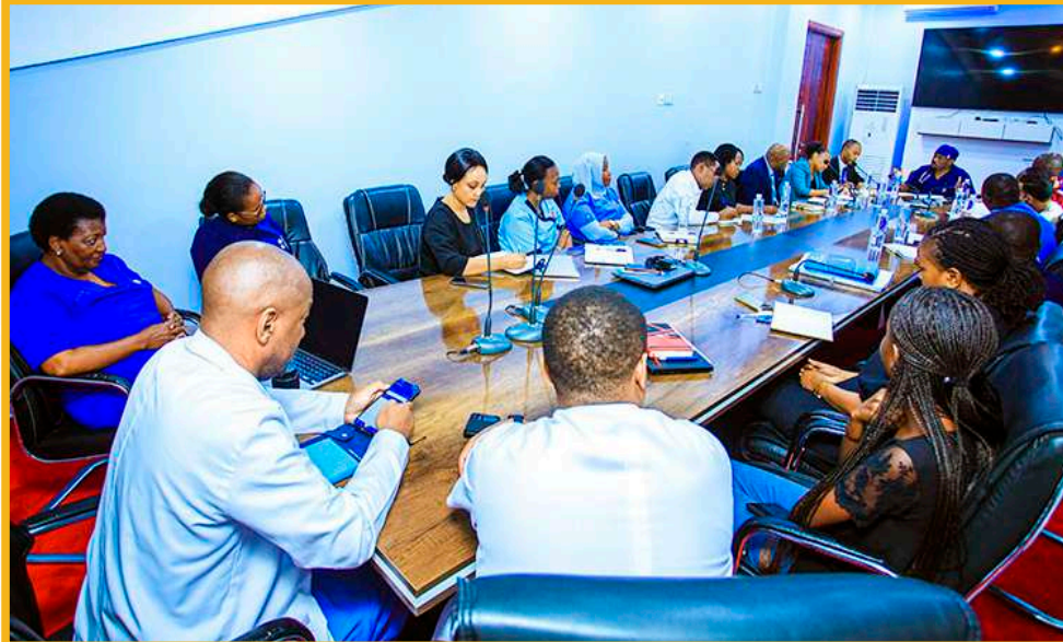
Right: A section of UDSM and JKCI Management and staff hold a meeting to discuss various issues on the collaboration between the two institutions.