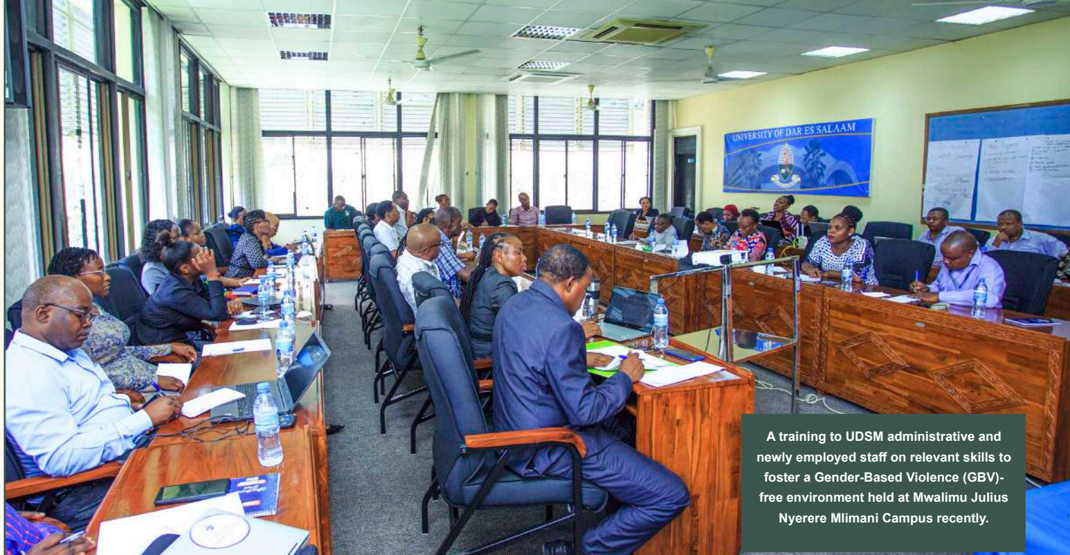
A training to UDSM administrative and newly employed staff on relevant skills to foster a Gender-Based Violence (GBV)-free environment held at Mwalimu Julius Nyerere Mlimani Campus recently.