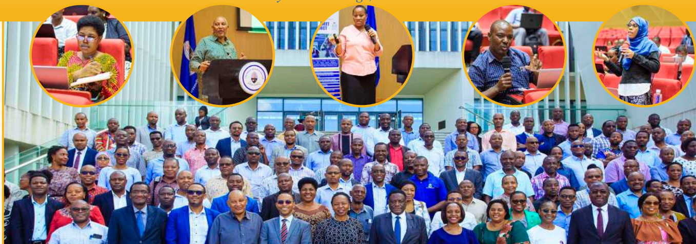
Participants of the two-day workshop on the curriculum review process at UDSM which was held at Mwalimu Julius Nyerere Mlimani Campus recently. The workshop was attended by over 150 stakeholders, including top management, principals, deans and directors, heads of department, and curriculum developers.

The University of Dar es Salaam (UDSM) has made remarkable progress in its curriculum review initiative by successfully reviewing and updating 98 undergraduate and postgraduate programmes as of July 2024, this Newsletter can report.