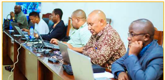
UDSM-HEET Project Monitoring, Evaluation and Lesson Learned (MELL) Committee members in one of its meetings.

As the UDSM-HEET Project continues to evolve, the MELL committee remains a pillar in ensuring its success. With a multidisciplinary team, a clear monitoring framework, and ongoing commitment to improvement, the team is well-positioned to help the University achieve its ambitious goals under the HEET initiative.