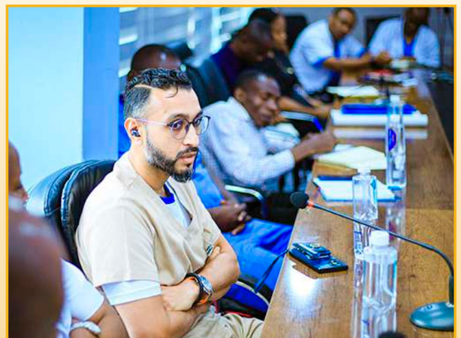
A section of UDSM and Jakaya Kikwete Cardiac Institute (JKCI) Management and staff in a meeting to discuss various issues on the collaboration between the two institutions.