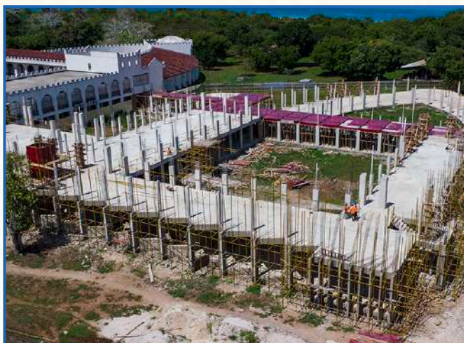
UDSM-HEET buildings construction site at the Institute of Marine Sciences (IMS), Buyu, Zanzibar.

These developments represent UDSM’s dedication to providing cutting-edge education and research opportunities, fostering an inclusive academic environment, and driving the economic transformation of Tanzania through higher education.