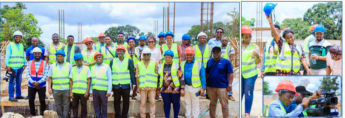
Optimism: A group of journalists and some Project implementation Unit members as they visited UDSM-HEET buildings construction site in Lindi region in September, 2024.