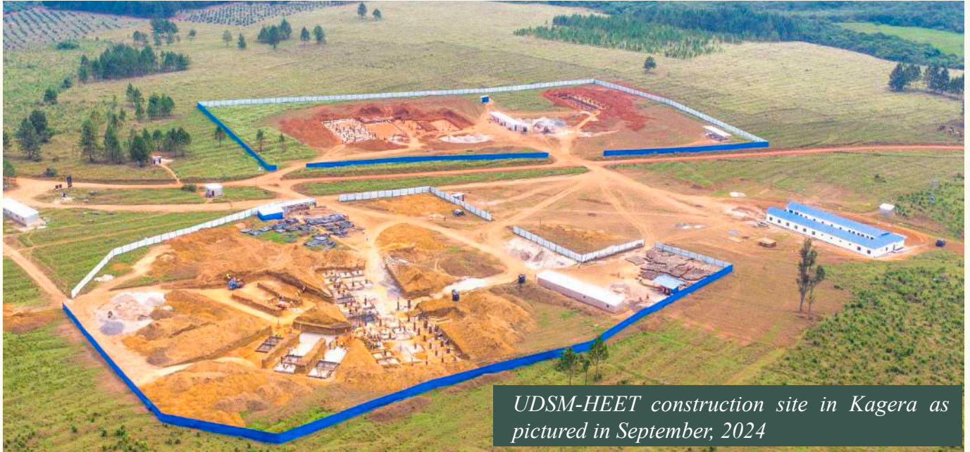
UDSM-HEET construction site in Kagera as pictured in September, 2024

Kagera. Kagera Region is undergoing a remarkable transformation as businesspeople rush to secure investment opportunities near the University of Dar es Salaam Business School (UDBS) campus, currently under construction.