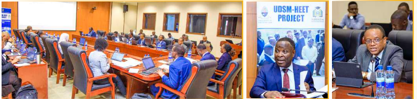
Planning for Big Results: 7 th Meeting of the Institutional Project Steering Committee (IPSC) of UDSM-HEET Project held on 21 st August, 2024.