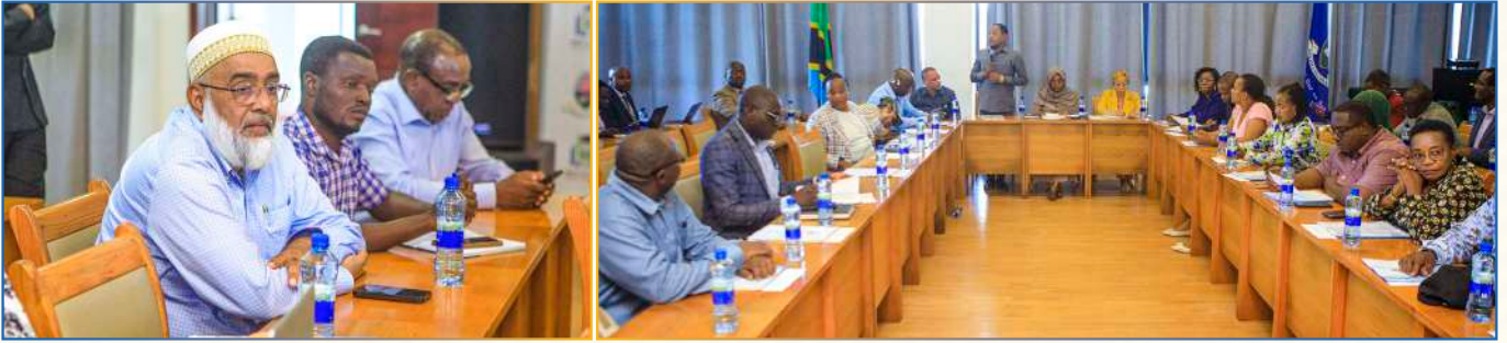
Deliberations: Members of the Parliamentary Committee on Education, Culture and Sports and a section of UDSM Management and staff when the committee visited UDSM - HEET Project recently.