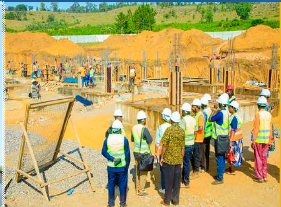
UDSM-HEET buildings under construction in various sites (Kagera, Lindi, Zanzibar and Dar es Salaam) as pictured recently.

The University of Dar es Salaam has handed over its sites for construction of 24 buildings under the Higher Education for Economic Transformation (HEET) Project to contractors with many promising prospects, it can be informed.