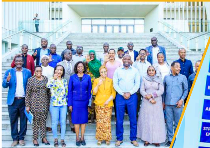
Members of the Parliamentary Committee on Education, Culture and Sports and a section of UDSM Management and staff when the committee visited UDSM-HEET project recently.